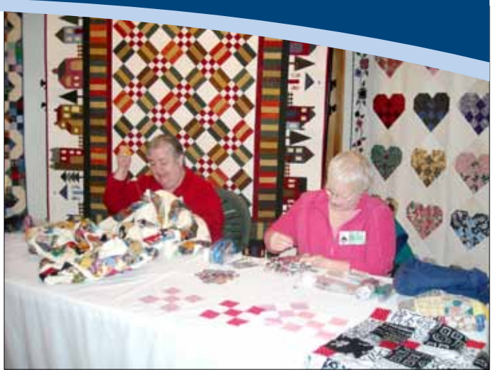
Pacific Spirit Quilters Display, Labour Day.

BC Hydro Burnaby Village Museum Gift Shop City of Burnaby – Mayor's Office HollyNorth Production Supplies McDonald's Canada Port Coquitlam Heritage and Cultural Society Tim Horton's