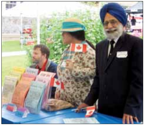
Multi-lingual information was handed out on Canada Day by staff and volunteers.