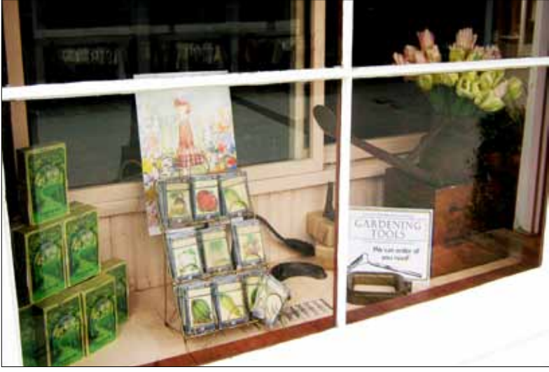
Garden tools for 'sale' at the General Store.