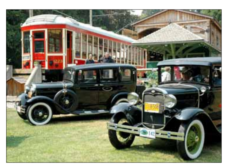
The Model "A" Ford Club of America.

Several other events throughout the year brought repeat visitors as well as new ones to the museum. The Model "A" Ford Club of America chose the BVM for their International Convention, bringing 190 vehicles to the site. Our annual Haunted Village event was as popular as ever and the Halloween Hysteria theme helped tie the experience together for visitors. Heritage Christmas continued to attract large numbers of visitors wishing to relive the simplicity of a 1920s seasonal experience. Father Christmas remained a great favourite of this six-week-long event, and Footlight Theatre Company returned to present its Christmas play. The museum's members and community partners were honoured at their own special events during opening weekend in May and in December during Heritage Christmas.