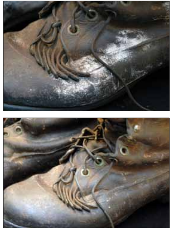
Before and after treatment.

The museum continued with its professional outreach work and supplied collections management and object treatment advice to a wide range of community partners which included: the Richmond Museum, the Nikkei Center, the Museum of Vancouver, the North Vancouver Museum, the Canadiana Costume Society, and the Surrey Heritage Rail Society. We were especially happy to assist colleagues at the Museum of the Highwood, in High River Alberta during their emergency response to a fire and flood disaster.