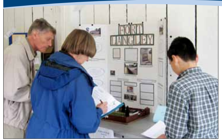
Volunteer judges at Heritage Fair.

Our seven school programs continue to enjoy growing popularity. Ten themed youth camps were offered during Spring Break and the summer months. One new camp debuted in 2010 -Archeology Explorers. Campers got the chance to use a mock excavation unit and participate in other archaeology-themed activities. Several workshops were also offered for the general public. New workshops were well attended: a child and parent wall hanging quilting workshop and a cookie cutters workshop just in time for the winter holiday season. The forge was open throughout the year with new students signing up for all four levels of blacksmithing. Cemetery walking tours continued at Forest Lawn and New Westminster cemeteries. The museum offered walking tours of Burnaby Heights and Grace Ceperley gardens, while our Haunted Deer Lake walking tour enjoyed an eight-day run. Finally, special tours were prepared for BC Power Pioneers, SFU International Teachers Training Program, and SFU Teacher Training. Once again the UFCW chose the museum for its annual family event and saw a record number of participants.