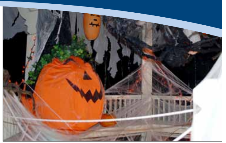
Haunted Village - Halloween Hysteria.

"Been in BC for 17 days, this is one of the best!" Guest comment book, June 6